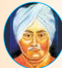
Lala Lajpat Rai: (1865-1928)

Frail of body but possessing heroic spirit, voluntarily opted for a life of self denial and renunciation. He fulfilled his pledge of 25 years of honorary service as the first Principal of the first DAV College at Lahore.